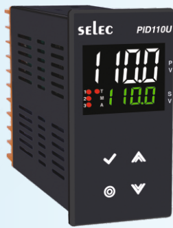
96 x 48mm