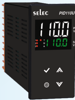
96 x 48mm