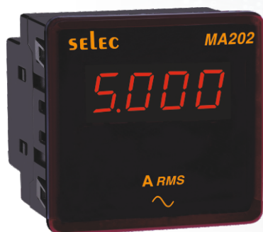
72 x 72mm