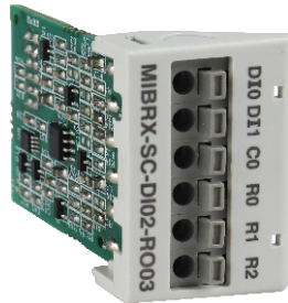
Figure 1.1 : Front view Patents applied worldwide