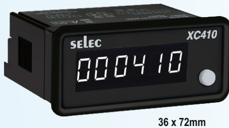
36 x 72mm