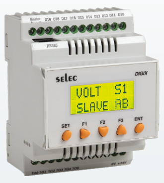
70 x 90 x 66.4mm