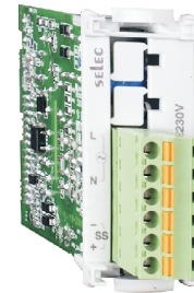
Figure 1.1 : Front view