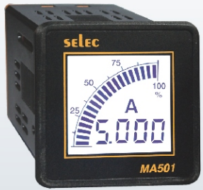
48mm x 48mm