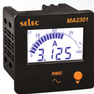
72 x 72mm