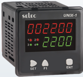
72 x 72 mm