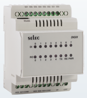
70 x 90 x 66.4mm